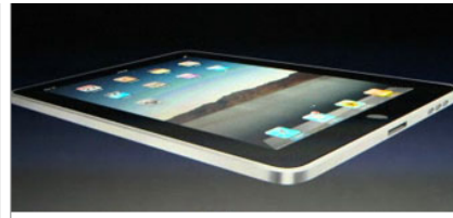
Apple's iPad tablet